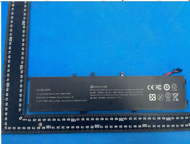
Front view of battery

The information above is believed to be accurate and represents the best information currently available to us. However, concorde makes no warranty of merchantability or any other warranty, express or implied, with respect to such information, and we assume no liability resulting from its use. Users should make their own investigations to determine the suitability of the information for their particular purposes. Although reasonable precautions have been taken in the preparation of the data contained herein, it is offered solely for your information, consideration and investigation. This material safety data sheet provides guidelines for the safe handling and use of this product; it does not and cannot advise on all possible situations, therefore, your specific use of this product should be evaluated to determine if additional precautions are required.