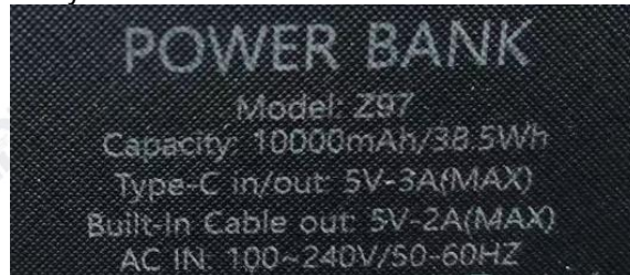
Label of battery