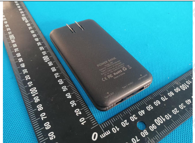
Back view of battery