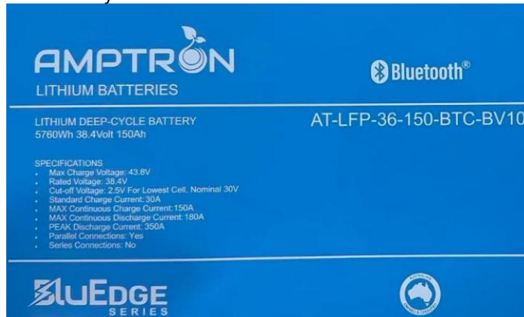
Label of battery