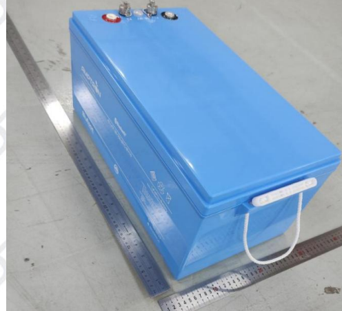
Back view of battery