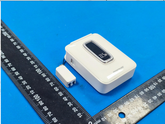
Front view of battery

The information above is believed to be accurate and represents the best information currently available to us. However, concorde makes no warranty of merchantability or any other warranty, express or implied, with respect to such information, and we assume no liability resulting from its use. Users should make their own investigations to determine the suitability of the information for their particular purposes. Although reasonable precautions have been taken in the preparation of the data contained herein, it is offered solely for your information, consideration and investigation. This material safety data sheet provides guidelines for the safe handling and use of this product; it does not and cannot advise on all possible situations, therefore, your specific use of this product should be evaluated to determine if additional precautions are required.