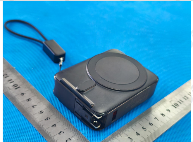
Back view of battery