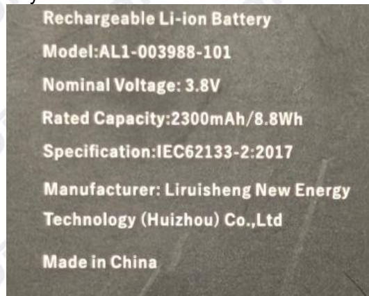
Label of battery