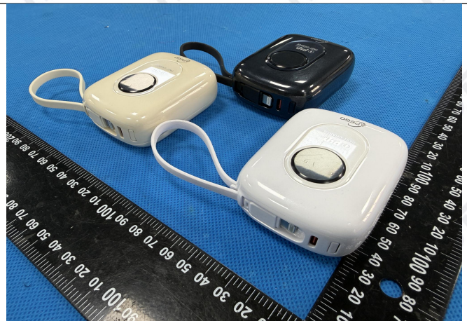
Back view of battery