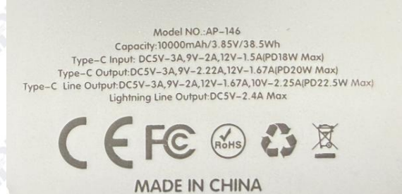
Label of battery