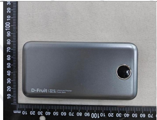
Back view of battery