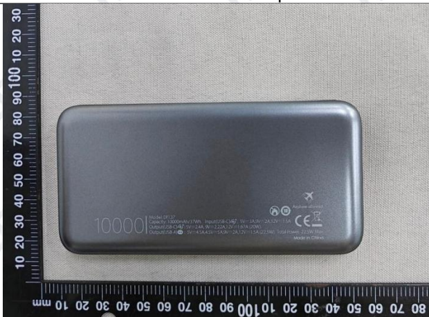
Front view of battery

The information above is believed to be accurate and represents the best information currently available to us. However, concorde makes no warranty of merchantability or any other warranty, express or implied, with respect to such information, and we assume no liability resulting from its use. Users should make their own investigations to determine the suitability of the information for their particular purposes. Although reasonable precautions have been taken in the preparation of the data contained herein, it is offered solely for your information, consideration and investigation. This material safety data sheet provides guidelines for the safe handling and use of this product; it does not and cannot advise on all possible situations, therefore, your specific use of this product should be evaluated to determine if additional precautions are required.