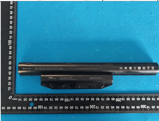
Front view of battery

The information above is believed to be accurate and represents the best information currently available to us. However, concorde makes no warranty of merchantability or any other warranty, express or implied, with respect to such information, and we assume no liability resulting from its use. Users should make their own investigations to determine the suitability of the information for their particular purposes. Although reasonable precautions have been taken in the preparation of the data contained herein, it is offered solely for your information, consideration and investigation. This material safety data sheet provides guidelines for the safe handling and use of this product; it does not and cannot advise on all possible situations, therefore, your specific use of this product should be evaluated to determine if additional precautions are required.