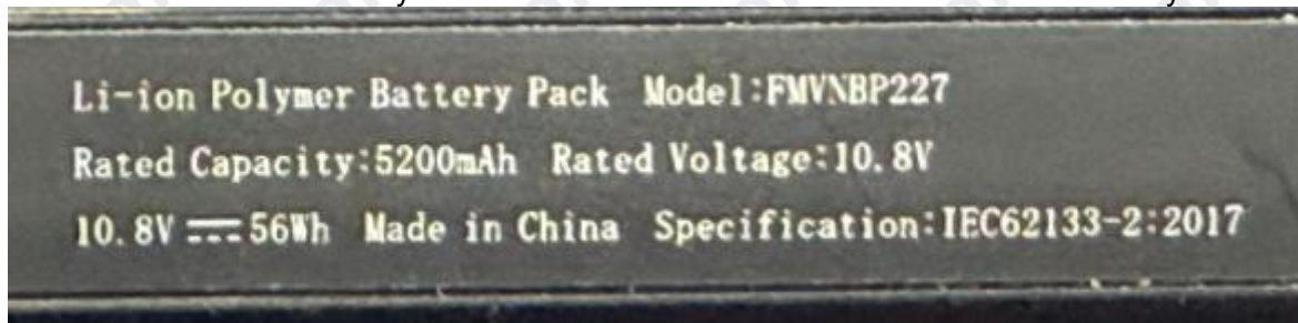
Label of battery