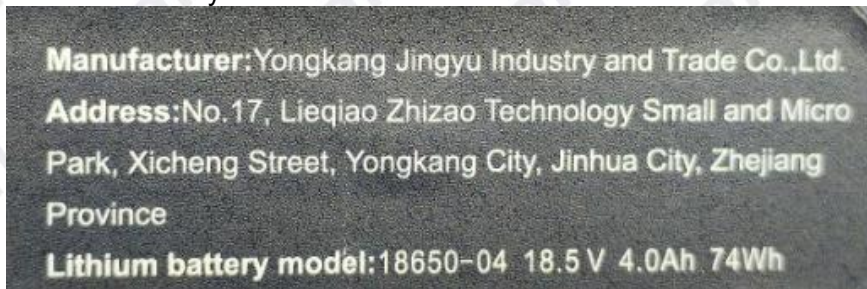
Label of battery