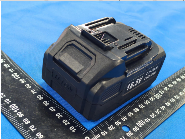
Front view of battery

The information above is believed to be accurate and represents the best information currently available to us. However, concorde makes no warranty of merchantability or any other warranty, express or implied, with respect to such information, and we assume no liability resulting from its use. Users should make their own investigations to determine the suitability of the information for their particular purposes. Although reasonable precautions have been taken in the preparation of the data contained herein, it is offered solely for your information, consideration and investigation. This material safety data sheet provides guidelines for the safe handling and use of this product; it does not and cannot advise on all possible situations, therefore, your specific use of this product should be evaluated to determine if additional precautions are required.