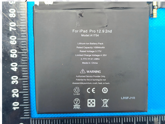
Label of battery