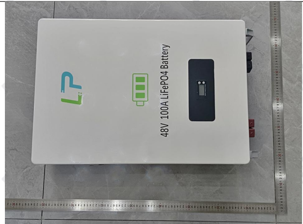
Back view of battery