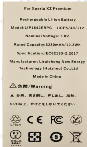
Label of battery