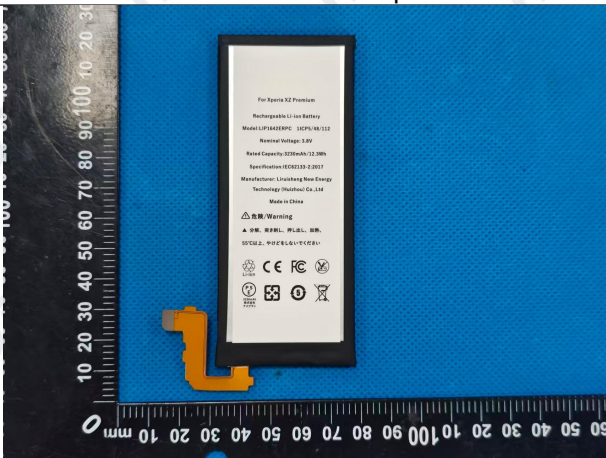
Front view of battery

The information above is believed to be accurate and represents the best information currently available to us. However, concorde makes no warranty of merchantability or any other warranty, express or implied, with respect to such information, and we assume no liability resulting from its use. Users should make their own investigations to determine the suitability of the information for their particular purposes. Although reasonable precautions have been taken in the preparation of the data contained herein, it is offered solely for your information, consideration and investigation. This material safety data sheet provides guidelines for the safe handling and use of this product; it does not and cannot advise on all possible situations, therefore, your specific use of this product should be evaluated to determine if additional precautions are required.