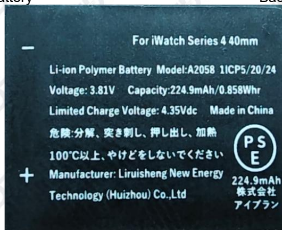
Label of battery