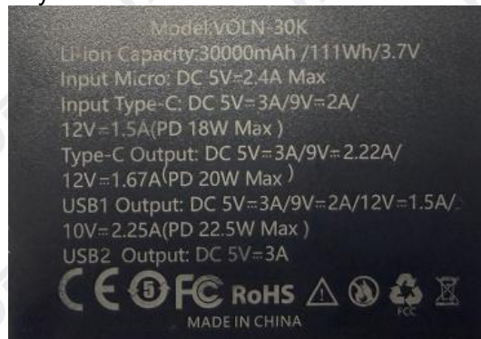
Label of battery