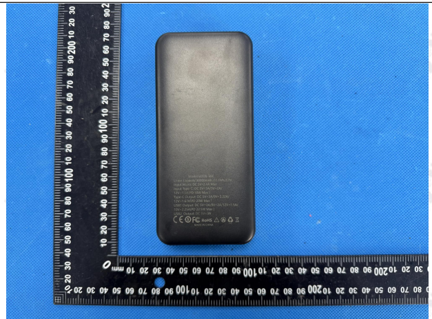
Back view of battery