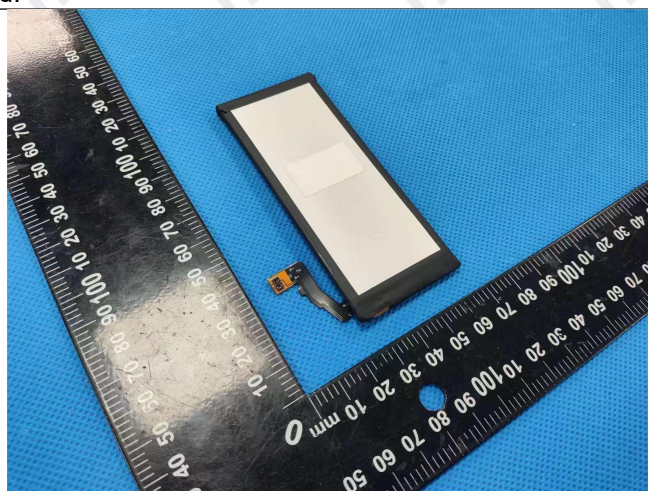
Back view of battery