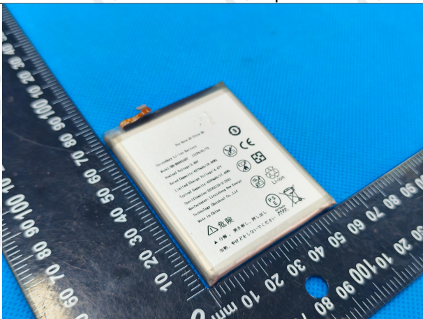
Front view of battery

The information above is believed to be accurate and represents the best information currently available to us. However, concorde makes no warranty of merchantability or any other warranty, express or implied, with respect to such information, and we assume no liability resulting from its use. Users should make their own investigations to determine the suitability of the information for their particular purposes. Although reasonable precautions have been taken in the preparation of the data contained herein, it is offered solely for your information, consideration and investigation. This material safety data sheet provides guidelines for the safe handling and use of this product; it does not and cannot advise on all possible situations, therefore, your specific use of this product should be evaluated to determine if additional precautions are required.