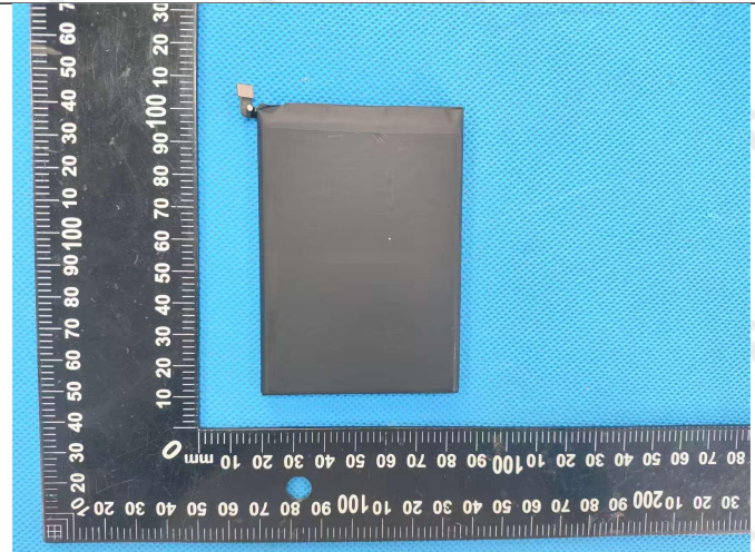
Back view of battery