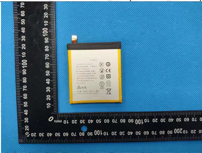
Front view of battery

The information above is believed to be accurate and represents the best information currently available to us. However, concorde makes no warranty of merchantability or any other warranty, express or implied, with respect to such information, and we assume no liability resulting from its use. Users should make their own investigations to determine the suitability of the information for their particular purposes. Although reasonable precautions have been taken in the preparation of the data contained herein, it is offered solely for your information, consideration and investigation. This material safety data sheet provides guidelines for the safe handling and use of this product; it does not and cannot advise on all possible situations, therefore, your specific use of this product should be evaluated to determine if additional precautions are required.