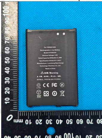
Front view of battery

The information above is believed to be accurate and represents the best information currently available to us. However, concorde makes no warranty of merchantability or any other warranty, express or implied, with respect to such information, and we assume no liability resulting from its use. Users should make their own investigations to determine the suitability of the information for their particular purposes. Although reasonable precautions have been taken in the preparation of the data contained herein, it is offered solely for your information, consideration and investigation. This material safety data sheet provides guidelines for the safe handling and use of this product; it does not and cannot advise on all possible situations, therefore, your specific use of this product should be evaluated to determine if additional precautions are required.