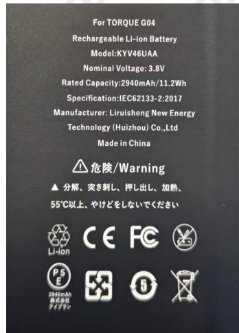
Label of battery