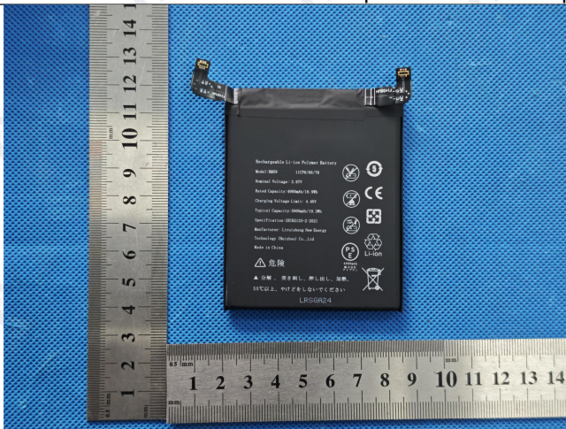
Front view of battery

The information above is believed to be accurate and represents the best information currently available to us. However, concorde makes no warranty of merchantability or any other warranty, express or implied, with respect to such information, and we assume no liability resulting from its use. Users should make their own investigations to determine the suitability of the information for their particular purposes. Although reasonable precautions have been taken in the preparation of the data contained herein, it is offered solely for your information, consideration and investigation. This material safety data sheet provides guidelines for the safe handling and use of this product; it does not and cannot advise on all possible situations, therefore, your specific use of this product should be evaluated to determine if additional precautions are required.