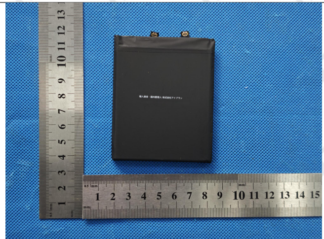
Back view of battery