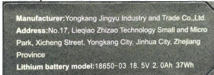
Label of battery