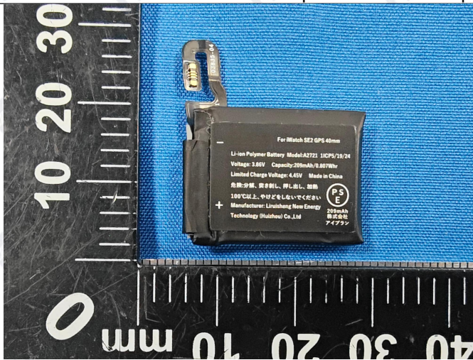
Front view of battery

The information above is believed to be accurate and represents the best information currently available to us. However, concorde makes no warranty of merchantability or any other warranty, express or implied, with respect to such information, and we assume no liability resulting from its use. Users should make their own investigations to determine the suitability of the information for their particular purposes. Although reasonable precautions have been taken in the preparation of the data contained herein, it is offered solely for your information, consideration and investigation. This material safety data sheet provides guidelines for the safe handling and use of this product; it does not and cannot advise on all possible situations, therefore, your specific use of this product should be evaluated to determine if additional precautions are required.