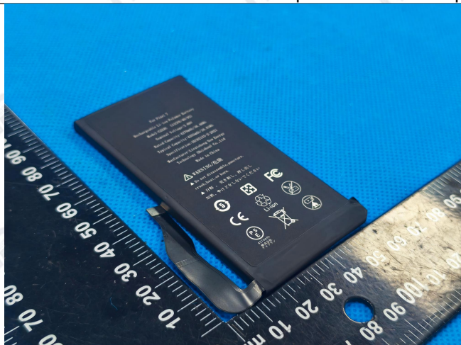
Front view of battery

The information above is believed to be accurate and represents the best information currently available to us. However, concorde makes no warranty of merchantability or any other warranty, express or implied, with respect to such information, and we assume no liability resulting from its use. Users should make their own investigations to determine the suitability of the information for their particular purposes. Although reasonable precautions have been taken in the preparation of the data contained herein, it is offered solely for your information, consideration and investigation. This material safety data sheet provides guidelines for the safe handling and use of this product; it does not and cannot advise on all possible situations, therefore, your specific use of this product should be evaluated to determine if additional precautions are required.