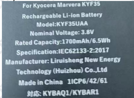
Label of battery