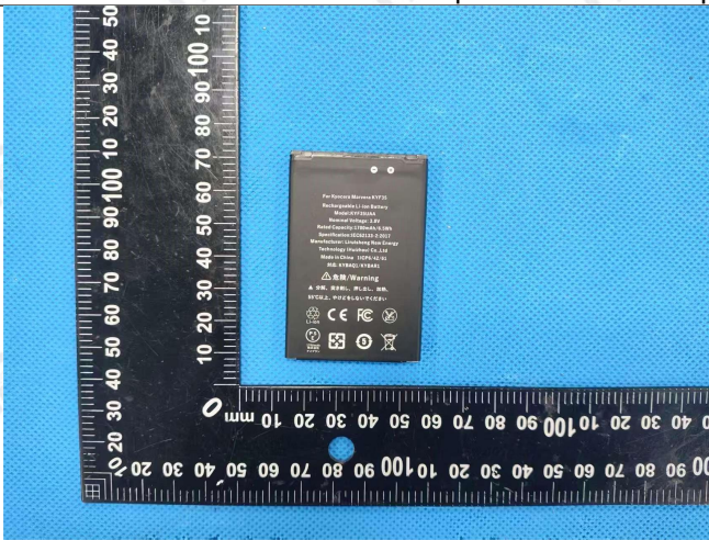
Front view of battery

The information above is believed to be accurate and represents the best information currently available to us. However, concorde makes no warranty of merchantability or any other warranty, express or implied, with respect to such information, and we assume no liability resulting from its use. Users should make their own investigations to determine the suitability of the information for their particular purposes. Although reasonable precautions have been taken in the preparation of the data contained herein, it is offered solely for your information, consideration and investigation. This material safety data sheet provides guidelines for the safe handling and use of this product; it does not and cannot advise on all possible situations, therefore, your specific use of this product should be evaluated to determine if additional precautions are required.