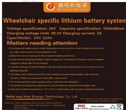
Label of battery