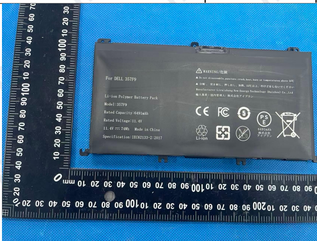
Front view of battery

The information above is believed to be accurate and represents the best information currently available to us. However, concorde makes no warranty of merchantability or any other warranty, express or implied, with respect to such information, and we assume no liability resulting from its use. Users should make their own investigations to determine the suitability of the information for their particular purposes. Although reasonable precautions have been taken in the preparation of the data contained herein, it is offered solely for your information, consideration and investigation. This material safety data sheet provides guidelines for the safe handling and use of this product; it does not and cannot advise on all possible situations, therefore, your specific use of this product should be evaluated to determine if additional precautions are required.