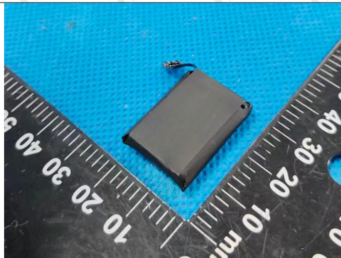
Back view of battery