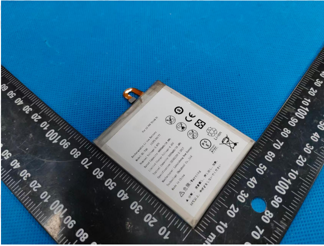
Front view of battery