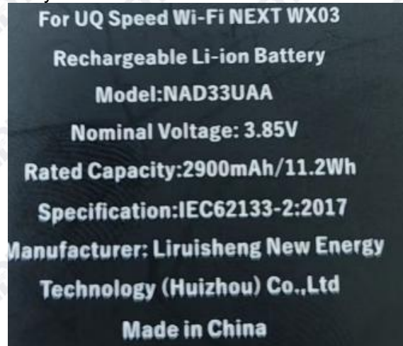
Label of battery