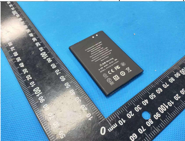
Front view of battery

The information above is believed to be accurate and represents the best information currently available to us. However, concorde makes no warranty of merchantability or any other warranty, express or implied, with respect to such information, and we assume no liability resulting from its use. Users should make their own investigations to determine the suitability of the information for their particular purposes. Although reasonable precautions have been taken in the preparation of the data contained herein, it is offered solely for your information, consideration and investigation. This material safety data sheet provides guidelines for the safe handling and use of this product; it does not and cannot advise on all possible situations, therefore, your specific use of this product should be evaluated to determine if additional precautions are required.