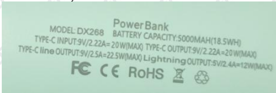
Label of battery