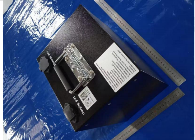
Back view of battery