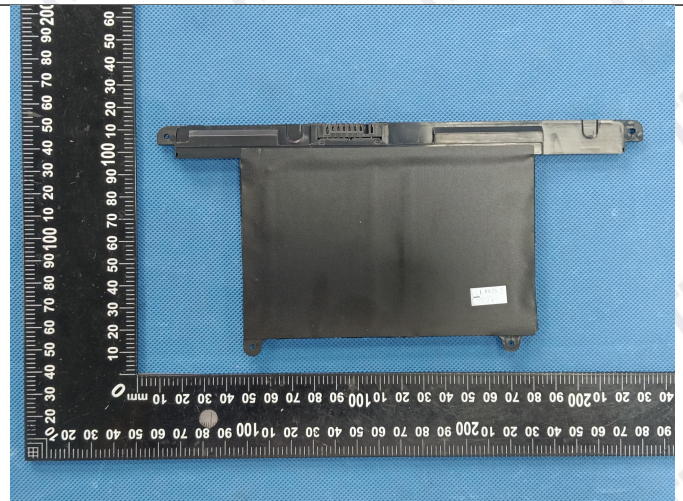
Back view of battery