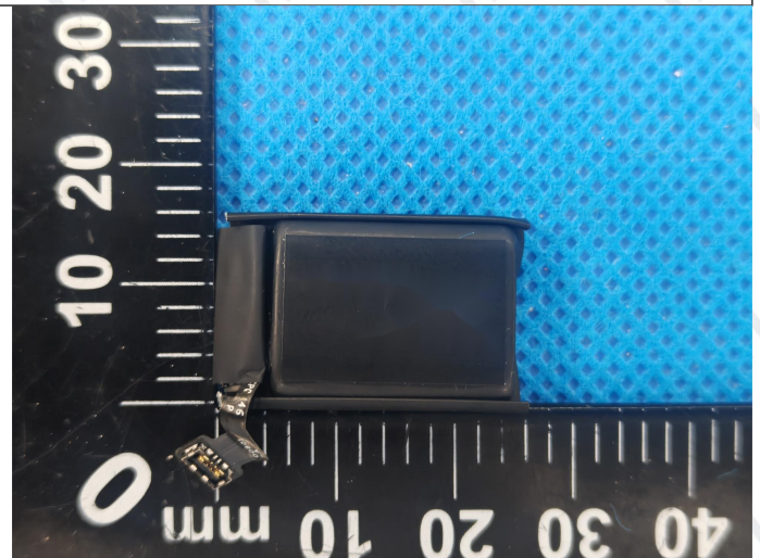
Back view of battery