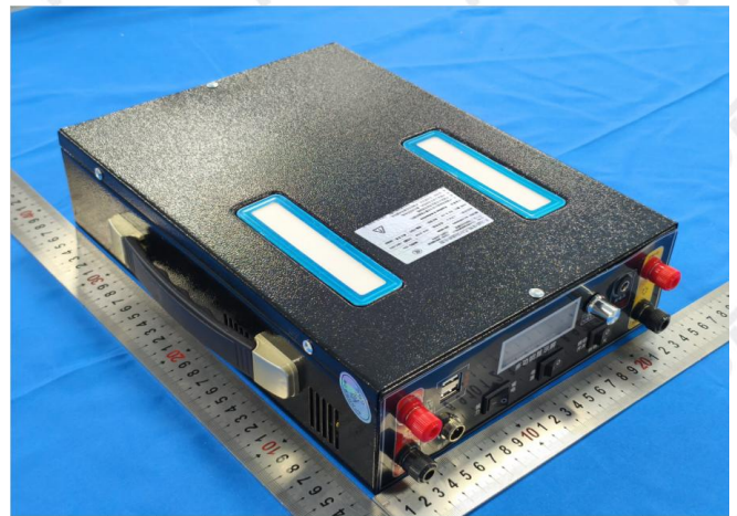
Back view of battery