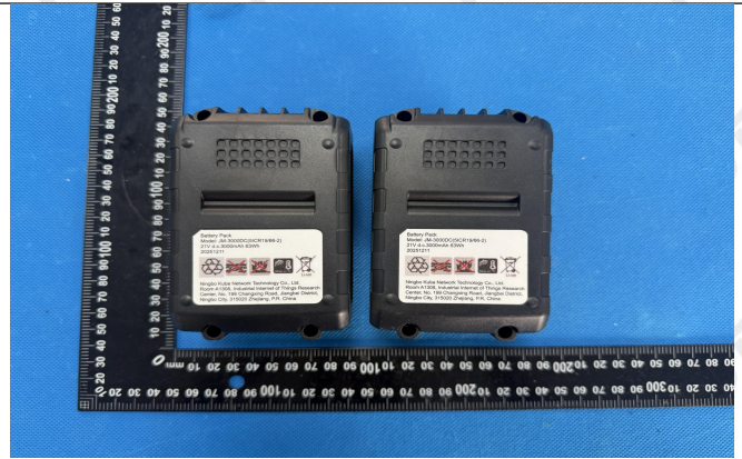
Back view of battery