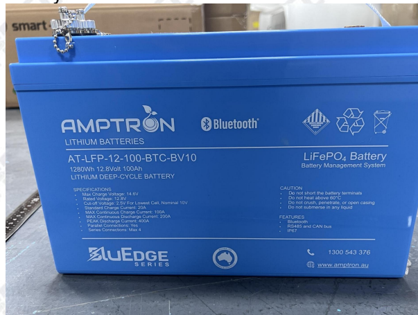
Label of battery