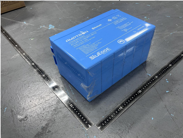
Front view of battery

The information above is believed to be accurate and represents the best information currently available to us. However, concorde makes no warranty of merchantability or any other warranty, express or implied, with respect to such information, and we assume no liability resulting from its use. Users should make their own investigations to determine the suitability of the information for their particular purposes. Although reasonable precautions have been taken in the preparation of the data contained herein, it is offered solely for your information, consideration and investigation. This material safety data sheet provides guidelines for the safe handling and use of this product; it does not and cannot advise on all possible situations, therefore, your specific use of this product should be evaluated to determine if additional precautions are required.