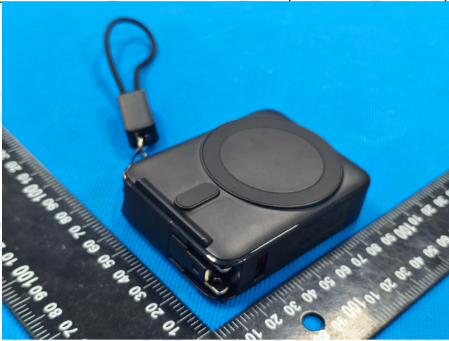
Front view of battery

The information above is believed to be accurate and represents the best information currently available to us. However, concorde makes no warranty of merchantability or any other warranty, express or implied, with respect to such information, and we assume no liability resulting from its use. Users should make their own investigations to determine the suitability of the information for their particular purposes. Although reasonable precautions have been taken in the preparation of the data contained herein, it is offered solely for your information, consideration and investigation. This material safety data sheet provides guidelines for the safe handling and use of this product; it does not and cannot advise on all possible situations, therefore, your specific use of this product should be evaluated to determine if additional precautions are required.