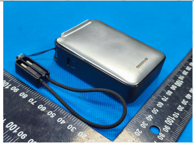
Back view of battery