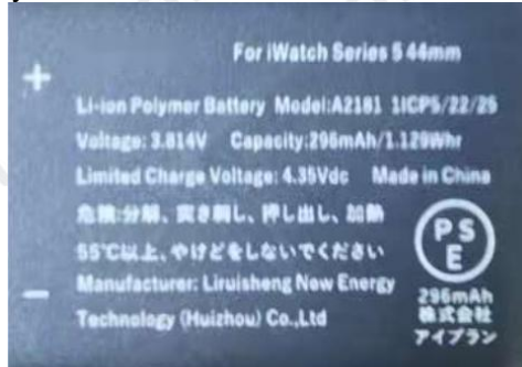
Label of battery