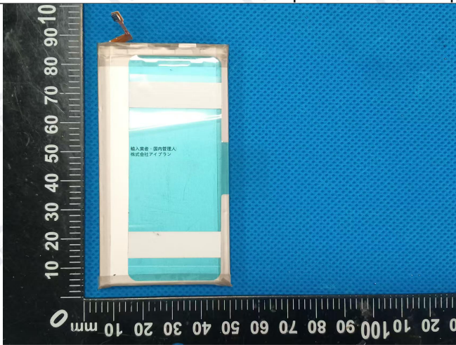
Front view of battery

The information above is believed to be accurate and represents the best information currently available to us. However, concorde makes no warranty of merchantability or any other warranty, express or implied, with respect to such information, and we assume no liability resulting from its use. Users should make their own investigations to determine the suitability of the information for their particular purposes. Although reasonable precautions have been taken in the preparation of the data contained herein, it is offered solely for your information, consideration and investigation. This material safety data sheet provides guidelines for the safe handling and use of this product; it does not and cannot advise on all possible situations, therefore, your specific use of this product should be evaluated to determine if additional precautions are required.