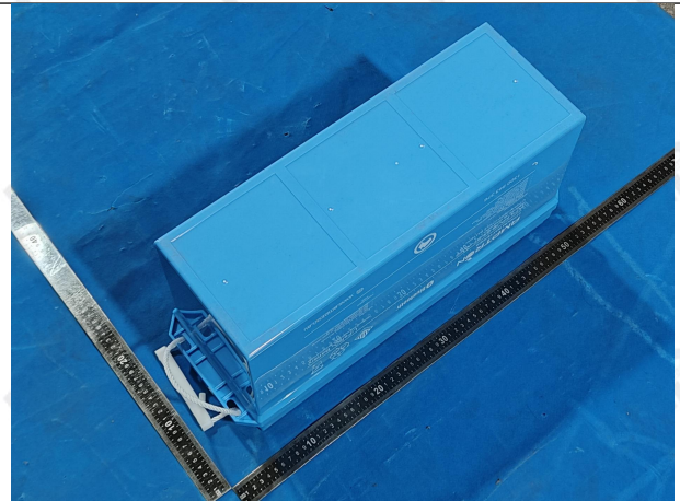
Back view of battery