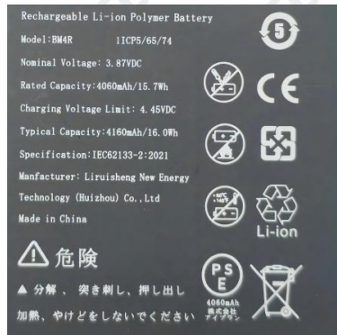
Label of battery