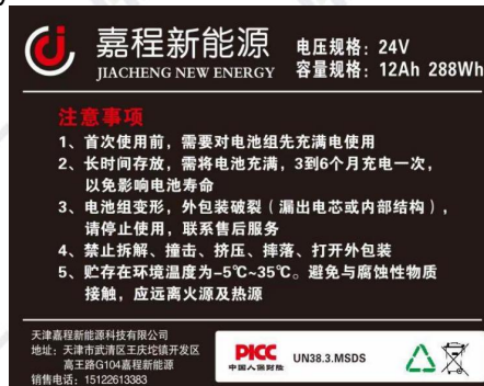
Label of battery