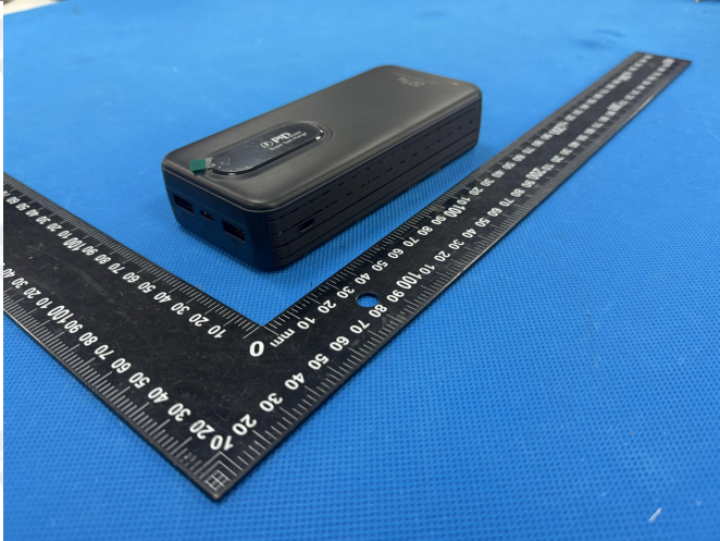
Front view of battery

The information above is believed to be accurate and represents the best information currently available to us. However, concorde makes no warranty of merchantability or any other warranty, express or implied, with respect to such information, and we assume no liability resulting from its use. Users should make their own investigations to determine the suitability of the information for their particular purposes. Although reasonable precautions have been taken in the preparation of the data contained herein, it is offered solely for your information, consideration and investigation. This material safety data sheet provides guidelines for the safe handling and use of this product; it does not and cannot advise on all possible situations, therefore, your specific use of this product should be evaluated to determine if additional precautions are required.