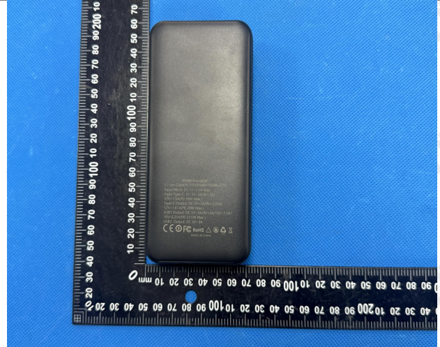
Back view of battery