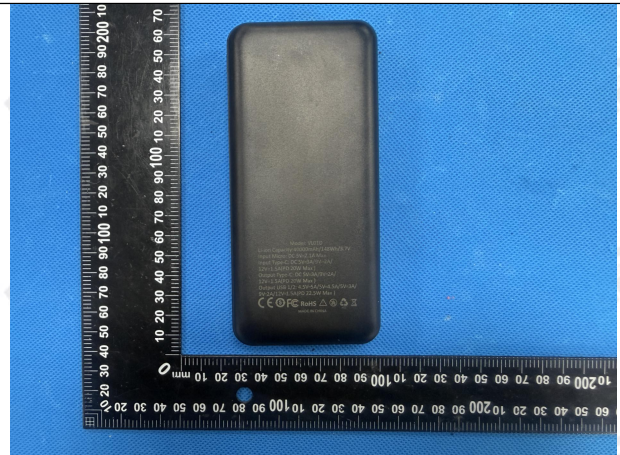
Back view of battery